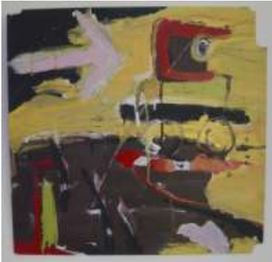
Mister Mobill keeps continuing from whence he came – 1999 oil and acrylic on found ply board 35 x 35 cm