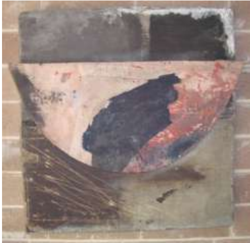
Witness – Trap of fire 1994 mixed media, acrylic, slate, cotton cloth, timber 51 x 51 cm