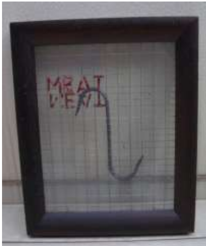
A State of Love. Used and Abused 1977 30 x 35 cm picture frame, meat hooks, glass, wire mesh, wood glaze