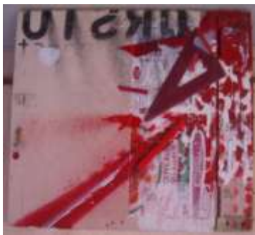
Untitled 2005 – mixed media on cupboard door 31 x 28 cm