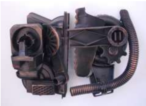
Construction Work at McLachlan Street (2002) cut up plastic toys, bronze enamel paint, 20 x 25 x 11cm