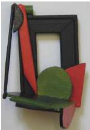
After Lorenz 2005 painted wood , picture frame 26 x 17 cm