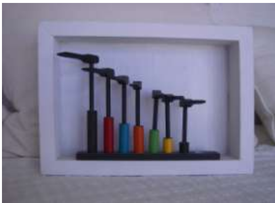
8 Small Weapons 2003 painted timber & piano parts 27x15x 5 cm