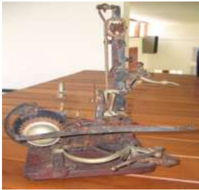
Untitled (Typewriter) – Typewriter parts, timber 17 x 17 x 25 cm