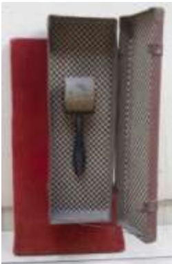
Rolling 1977 Tie Box , ink roller, timber, velvet 40 x 25 cm