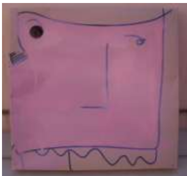
Untitled (Picasso pizza) 2005, texta, acrylic, thumb tack on pizza box 33 x 33 x 4 cm