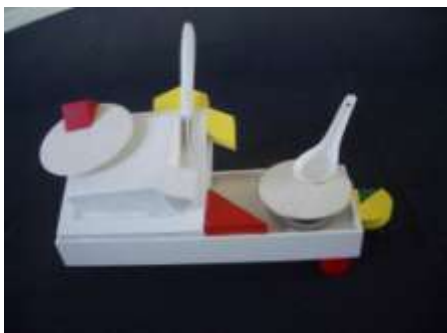
Untitled ( For Gavin ) 2008 timber, plaster, plastic spoon, knife, bowls