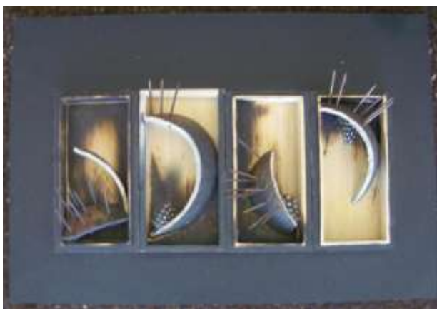
Untitled 1990's gourd, timber, feathers, nails 50 x 25 x 5 cm